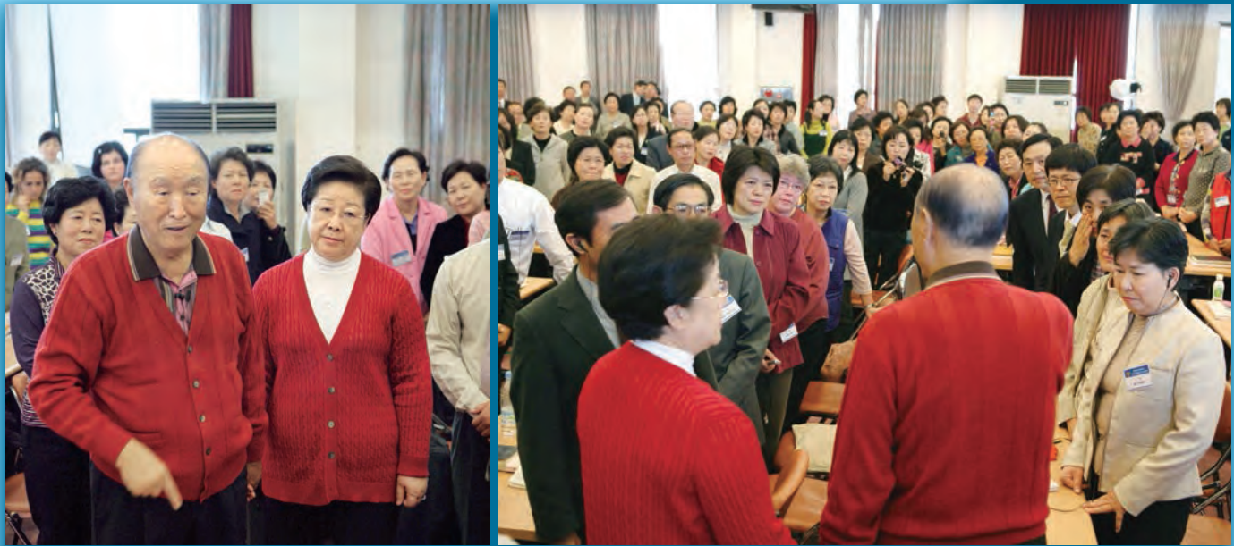
True Parents at the Second Education Session Proclaiming the Completion of the Liberated Realm of the Portion of Responsibility (November 13). At these workshops, the Principle is presented from a new viewpoint.